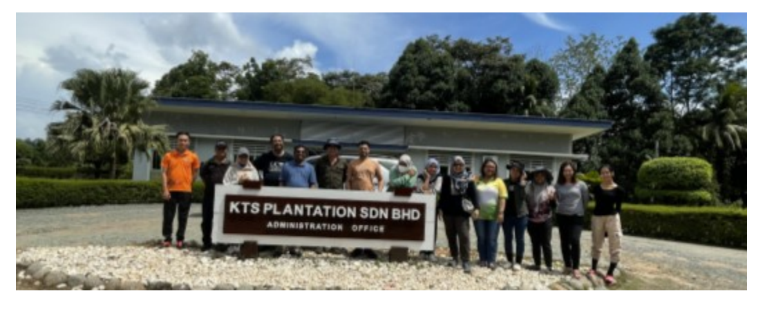
Group photo with the delegates before they depart from KTS Plantation.

Field visit to harvesting area where tree harvesting was demonstrated.