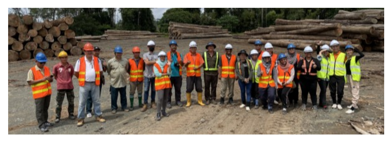
Group photo with the delegate at stumping, last field visit area.