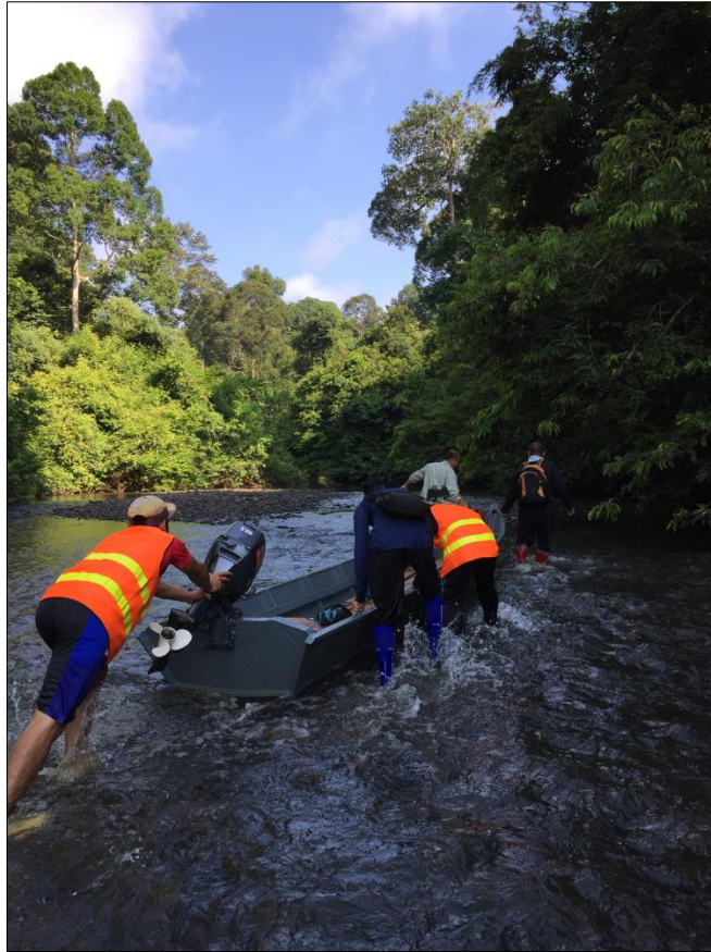
Photo 11 Some of the obstacle in river. The boat has to be pulled and pushed because the water level is not deep enough for the boat.