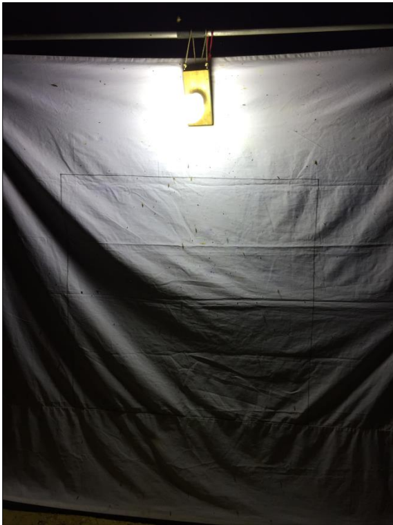
Photo 9 Light trapping. One of the method to look into the insect diversity.