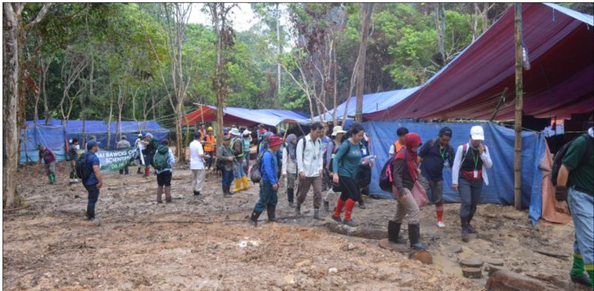
Photo 7 Researcher getting ready to go to their trails