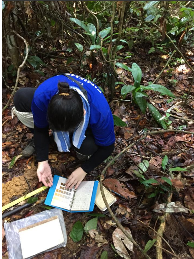
Photo 15 FRC team doing soil assessment in Trail 6