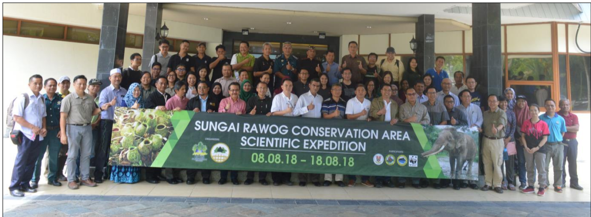
Photo 6 Group photo during launching and flagged off