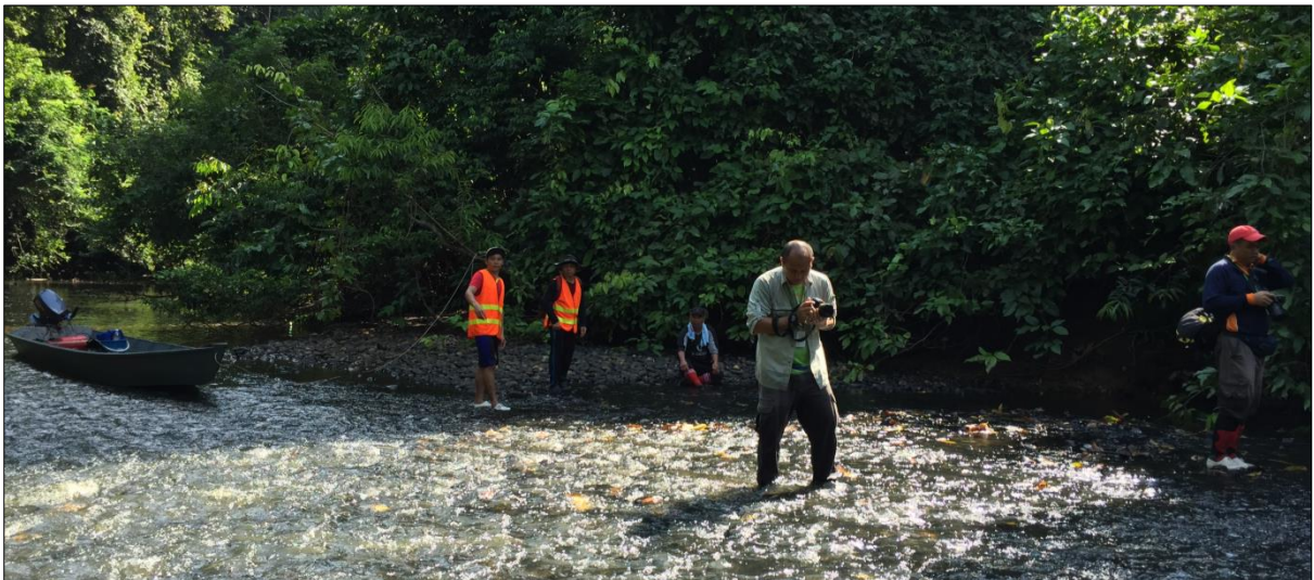
Photo 12 River cruise with FRC ecotourism division