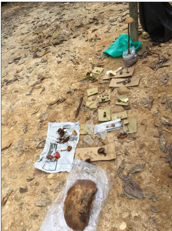
Photo 10 some of fungi sample collected from trail