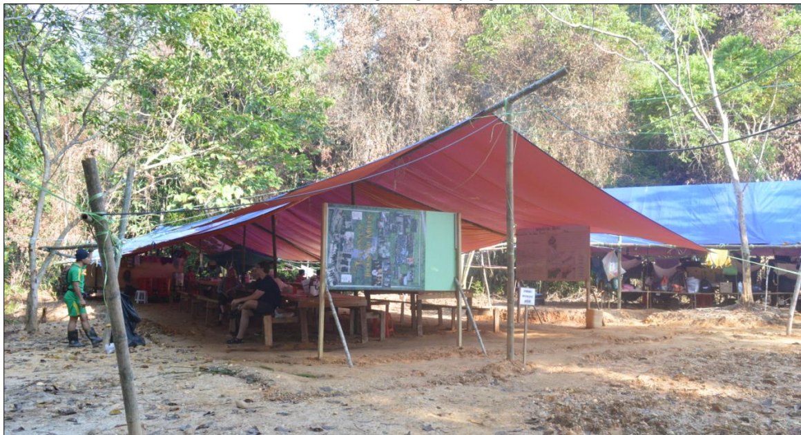
Photo 8 The main hall where the most all of the activities are conducted here including eating, resting and presentation of findings